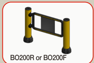
BO200R or BO200F