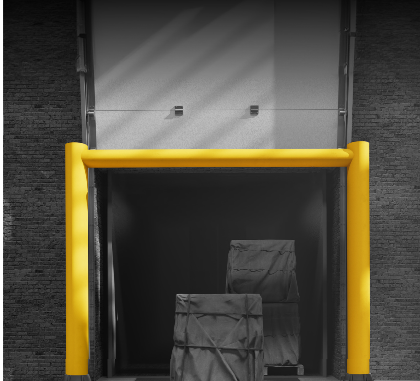
GP GOAL POST 250R