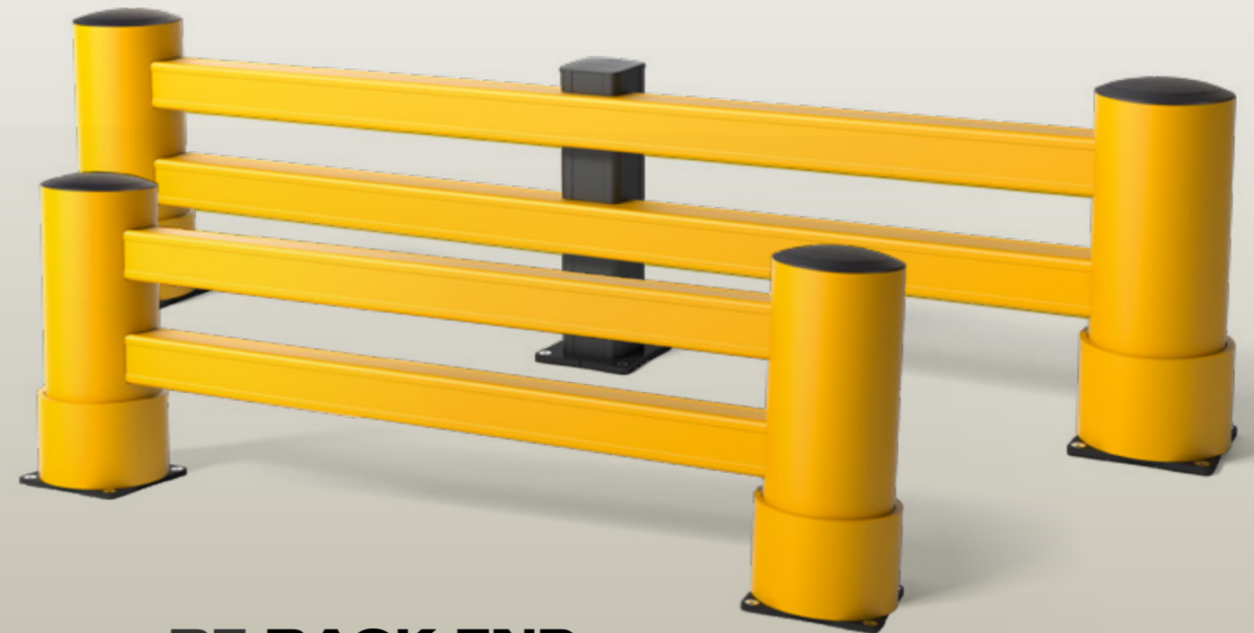
RE RACK END >>> 8.5 kJ