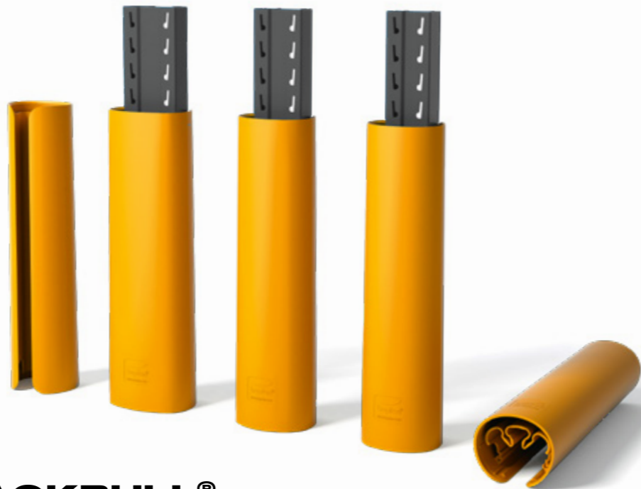
RACKBULL® >>> 400 J

Forklift collisions with racks are among the most common workplace accidents in warehouses. Workers are often under time pressure as they drive and manoeuvre forklifts, pallet trucks or stackers through tight spaces between racks. This can lead to collisions and damage. The consequences can be serious, from minor property damage to collapsed racking. Prevent accidents and protect your racking with Boplan rack protection.